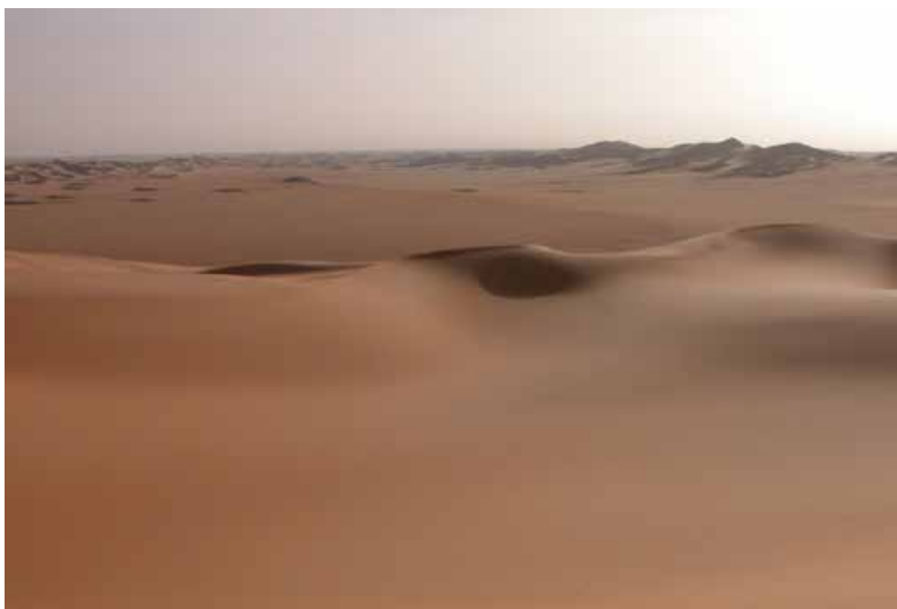
Fig. 2. The Ténéré desert near Adrar Chiriet (19°17'N, 09°14'E).

Literature records: Bilma (Angel 1936, Angel and Lhote 1938, as Leptotyphlops macrorhynchus bilmaensis ; Hahn and Roux-Estève 1979, Hahn and Wallach 1998, Trape 2002, as Leptotyphlops cairi ); Téouar (Villiers 1950a, 1950b, as Leptotyphlops macrorhynchus bilmaensis ). Remarks: IFAN 47-4-38 from Téouar (Aïr Mountains) is apparently lost: we have been unable to find it in Dakar or Paris. However, data on this specimen provided by Villiers (1950b) exclude Myriopholis algeriensis , Myriopholis boueti , Myriopholis adleri , and Myriopholis lanzai , and fit well with Myriopholis cairi .