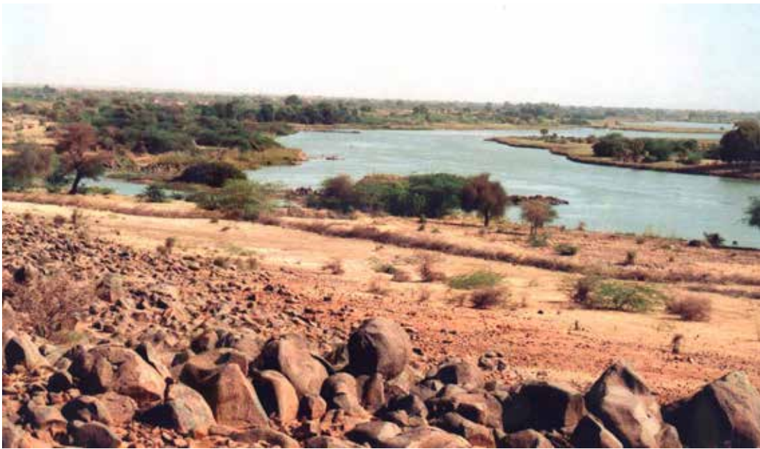
Fig. 7. The Niger River near Ayorou in eastern Niger (14°42'N, 00°55'E).

in southern, eastern, and central Africa. Trape and Baldé (2014) revived smithi Bocage, 1882, for this subspecies. Literature records: Gourgou (Chirio 2009).