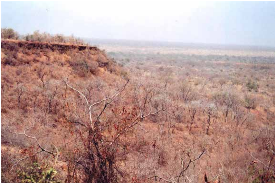
Fig. 5. View of the Sudan savanna in W National Park in southwestern Niger during the dry season (12°25'N, 02°30'E).

Literature records: SW Niger (Roman 1974, as Dromomphis praeornatus : 13 specimens); Gaya, La Tapoa (Chirio 2009).