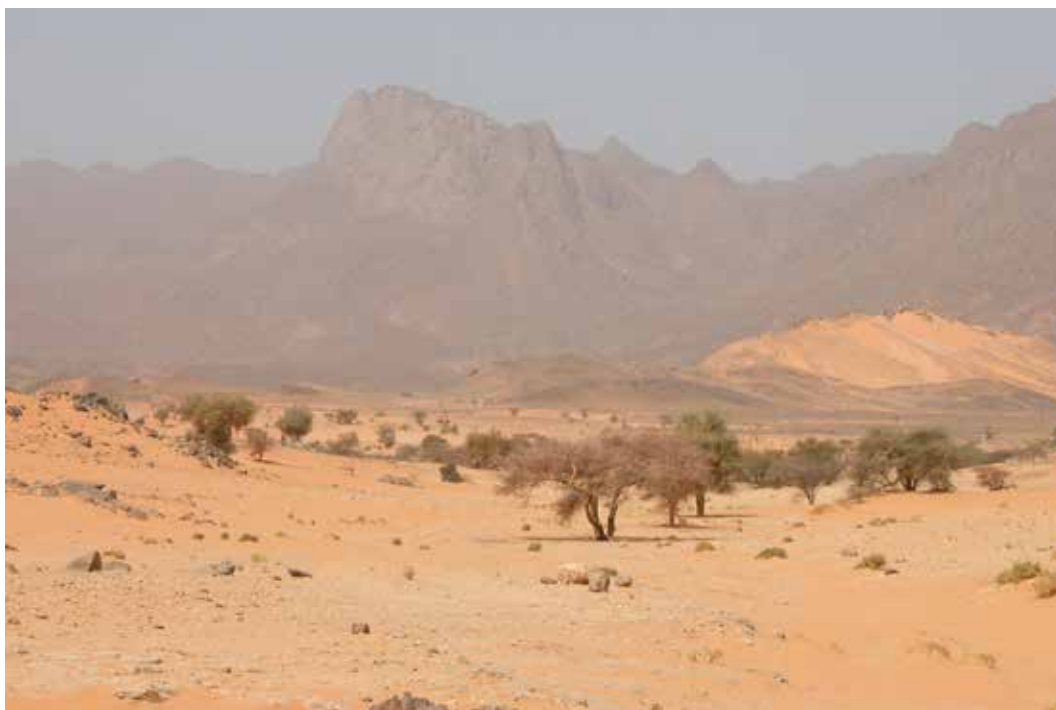
Fig. 6. View of Aïr Mountains in northern Niger (19°06'N, 08°54'E).

Localities: Aholé (1), Karosofoua (1), Simiri (1), Tékhé (5), Têla (3), Tounga Yacouba (15).