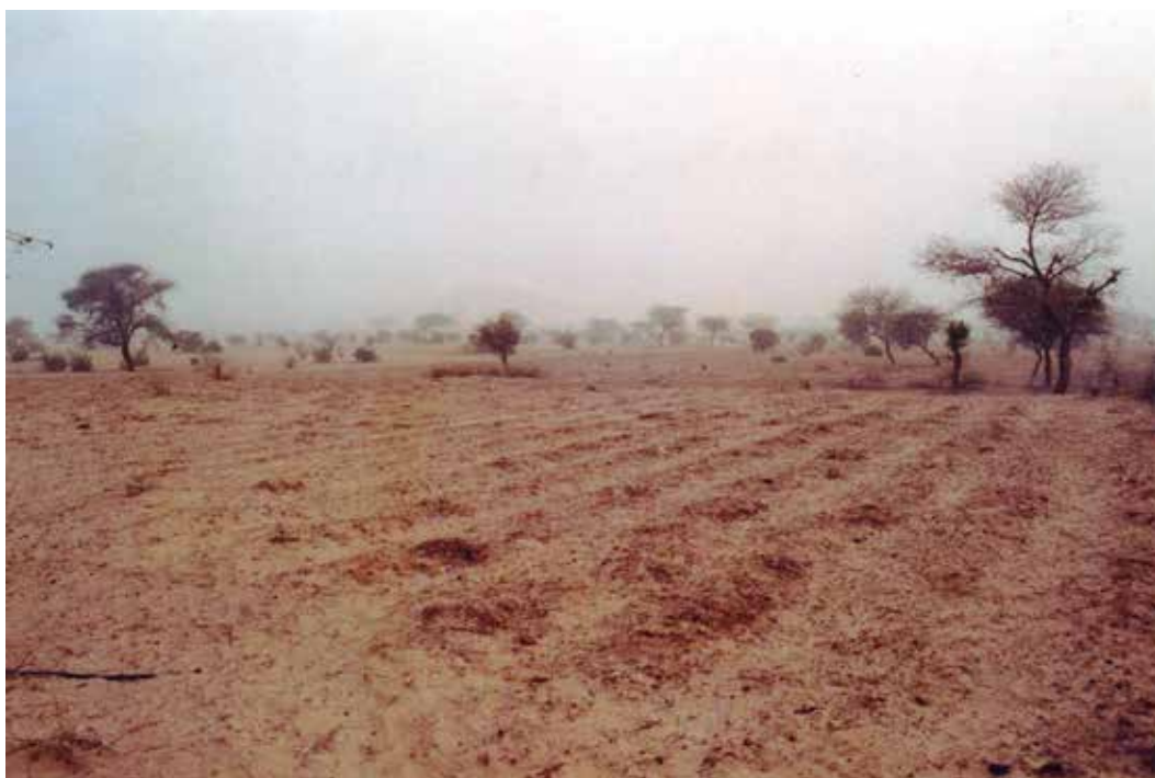
Fig. 4. Field in the Sahel near Chetimari in southwestern Niger during the dry season (13°15'N, 12°28'E).

Literature records: SW Niger (Roman 1974, as Prosymna meleagris : Two specimens); Alambaré, Gaya, La Tapoa (Chirio 2009); Alambaré, Kouré, La Tapoa, Malbaza (in error), Piliki, Tounga Yacouba, Têla (Chirio et al. 2011).