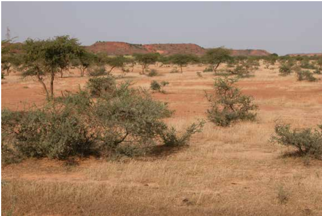
Fig. 3. A typical view of the Sahel north of Niamey (14°05'N, 01°42'E).

Localities: Kusa (1), Maradi (1, coll. MNHN), Saboulayi (9).